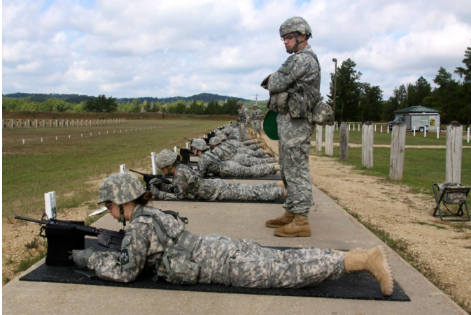
Basic rifle marksmanship is practiced on the range