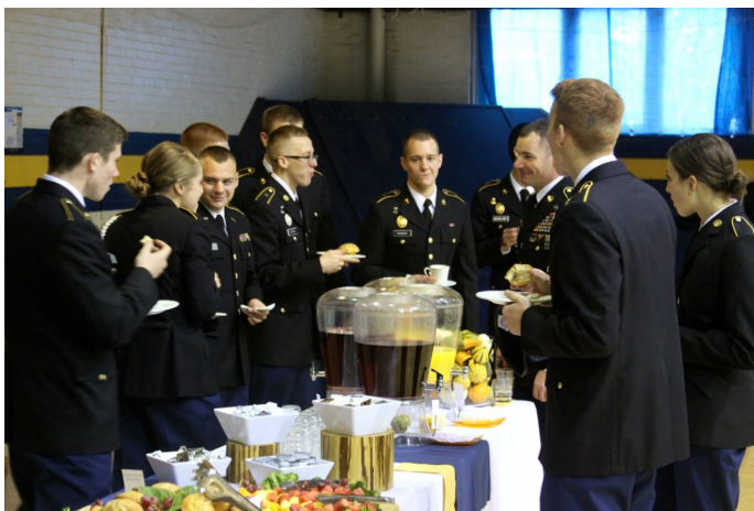
Cadets enjoy food and drink while congratulating their fellow classmates who just contracted at the conclusion of the Contracting and Veterans' Day Ceremony.