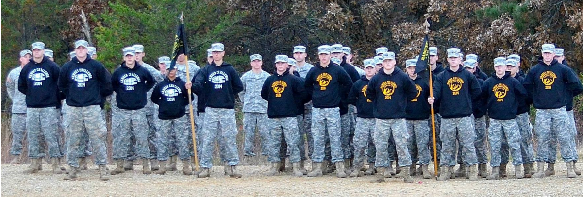
Below: Cadets from the Golden Eagle Battalion await the opening ceremony of the 2014 Task Force Ranger Challenge