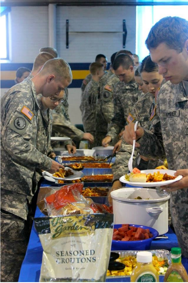
Cadets anxiously await a plateful of food provided by the Family Action Network Club after arriving back at Marquette following their rigorous three day Fall Leadership Development Exercise (Above).