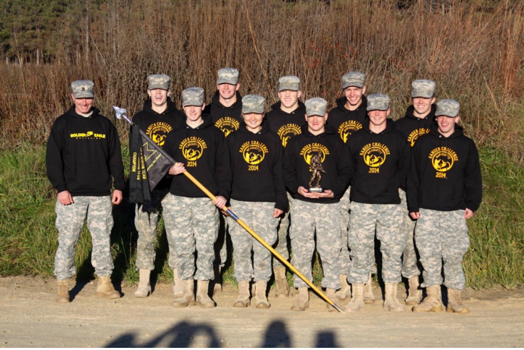
The 9-Person team, 3rd Place overall