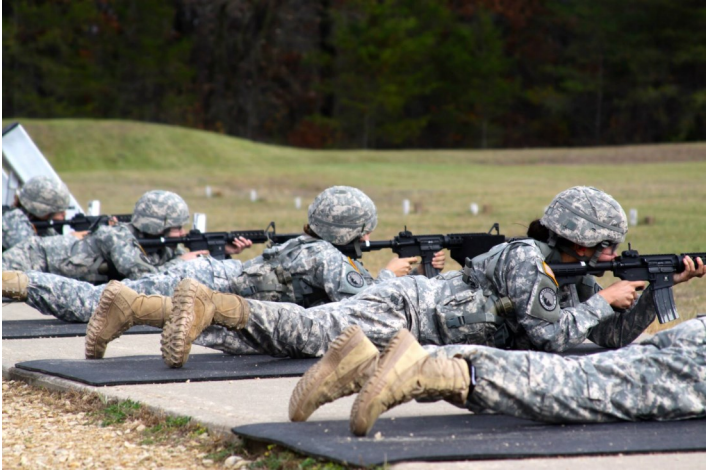
The 5-Female team competing on the range

From October 24-26, the Golden Eagle Battalion 1st place teams from the Task Force Ranger Challenge advanced to compete in the Brigade Ranger Challenge at Ft. McCoy, WI. The Battalion sent both the 9-Person and 5-Female teams from Marquette University. The Golden Eagle Battalion Cadets competed with a ton of heart and pushed themselves as hard as they could. We are beyond proud that our 5-Female team won 2nd Place and our 9-Person team, tied for second, achieving 3rd Place overall.