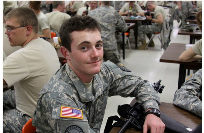
Below: Cadets plot points in preparation for both day and night land navigation