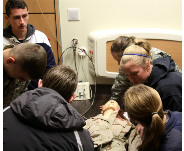
Cadets and shadow students assess and begin treating simulated injuries on a mannequin during the Nursing Lab.

From November 13-14 and February 6-7, Cadets of the Golden Eagle Battalion hosted 28 high school Shadow Students from across the country, some as far away as Washington state! These students were hosted by Cadets who were in the same undergraduate study program as the shadow was interested in. These shadows arrived early in the morning, just in time to participate in the Combat Water Survival Training or PT! Following their training, the shadows and their hosts went through all the classes that their host would normally attend. They then had an informational brief hosted by the MSIV's that expounded on all the extra-curricular ROTC activities. Following the brief, they all had dinner at the Marquette Annex. It was a great opportunity for the students to discuss their individual experiences up to that point. After going back to their host's dormitories for the night, the cadets and students participated in the Nursing Lab training that was covered by WISN 12 News or a lab where students were taught how to enter and clear rooms. Each shadow student was inserted into a squad with their host and got hands on with all the ROTC training. We hope to see all of them as incoming freshman in 2015!