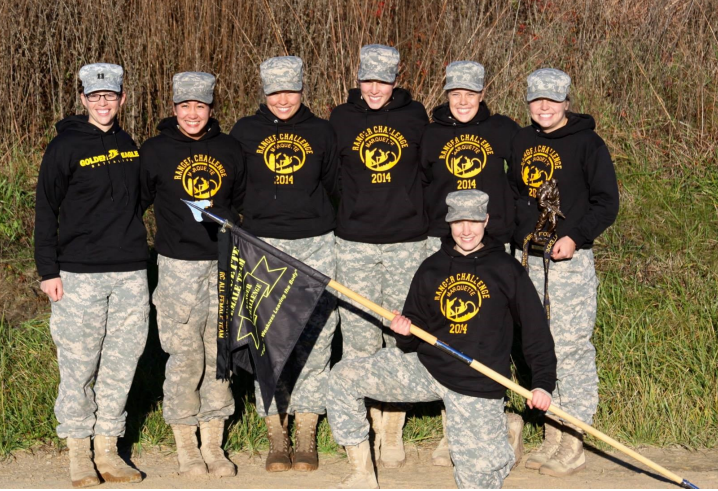
The 5-Female team, 2nd Place overall