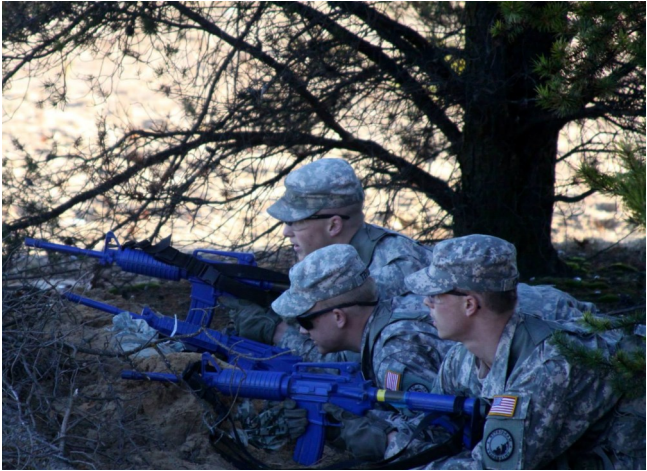
The 9-Person team laying down suppressing fire