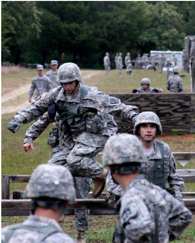
Cadets compete in the Confidence Course