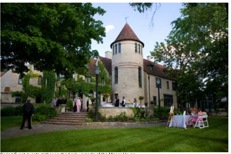
Spring Event guests gather on the back veranda of the Manor House