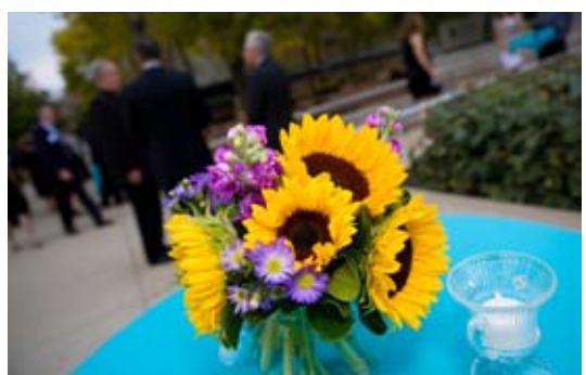
The Sunflower Centernies