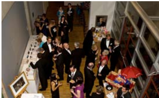
Guests bidding on Silent Auction items in the Museum Galleries