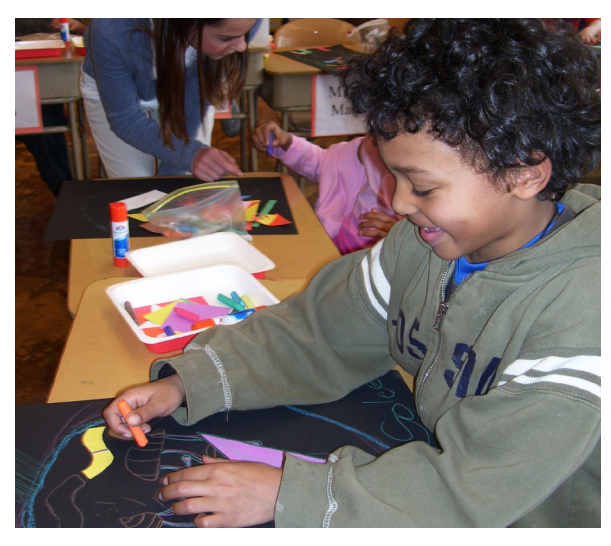
Student in Picasso Across Curriculum program